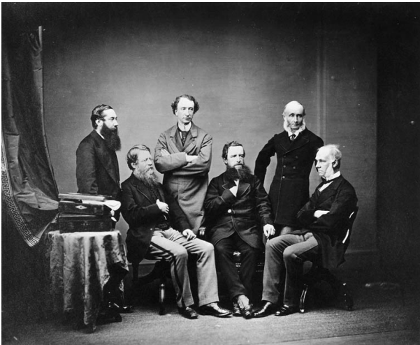
The British High Commissioners for the Treaty of Washington group for a picture.

The treaty between Great Britain and the US, leading to total demilitarisation and inaugurating permanent peaceful relations between the US and Canada, and the US and Britain.