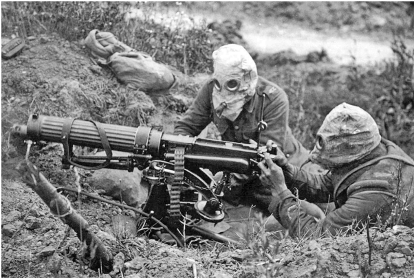
A British machine gun team wears anti-gas helmets in WWI.

ogical innovations in the field of infantry and artillery had been decisive factors in the outbreak and longevity of hostilities.