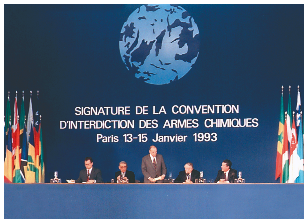
Opening for signature (1993) OPCW

As of July 2021, the CWC comprises 193 states parties. With this it is the world's most successful weapon control treaty. Only four states still need to ratify or accede to it: Egypt, Israel, North Korea and South Sudan.