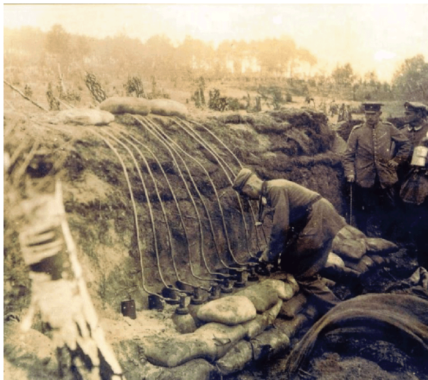
German battery of chlorine gas cylinders being prepared for an attack, awaiting the right weather conditions to prevent blowback; similar to the arrangement at Hill 60 in May 1915