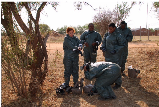
CBRN response training in the field.

The video lecture covers the following topics: