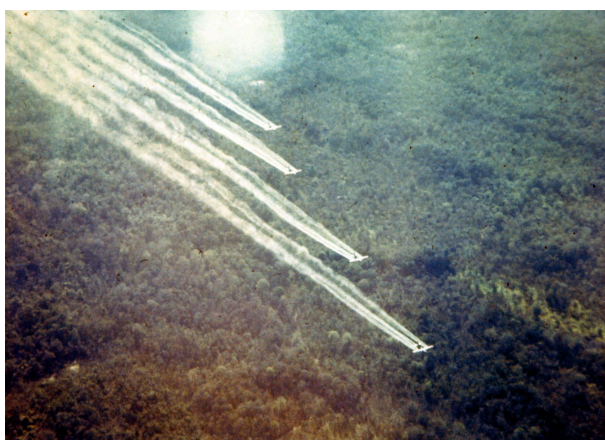
Operation Ranch Hand: Spraying Agent Orange to deny the enemy jungle cover during the Viêt-Nam war in the 1960s.

... the intentional application for hostile purposes of toxic substances against humans and their environment.